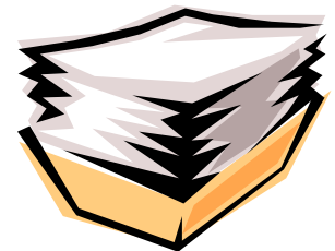
Tips and Tricks

To do this simply go to the Fabric menu > color. You can use one of the built in ones or create your own color