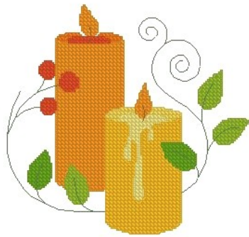
Jacobean Candles Christmas Sunbonnets