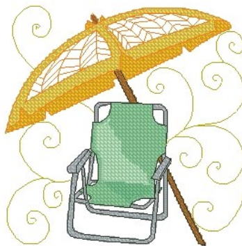
Magic Beach Umbrellas

The first of the Baby Alphabet Pictures follow: