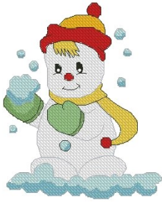
Baby Snowmen Jacobean Fruit Borders

Below is a small preview of some of the newest design sets that will be available for download.